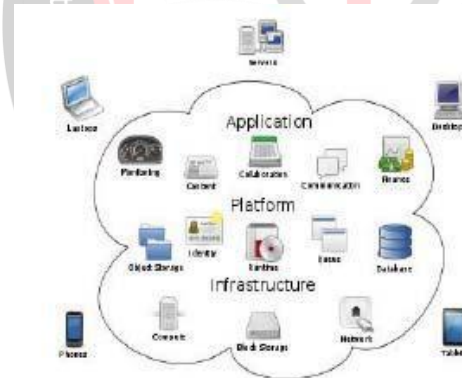
Figure 1. Cloud Computing [2]

The term Cloud Computing has been out lined in some ways by analyst corporations, academics, business practitioners and IT corporations. Clouds is an oversized pool of simply usable and accessible virtualized resources. These resources may be dynamically reconfigured to regulate to a variable load (scale), permitting additionally for an optimum resource utilization [2].