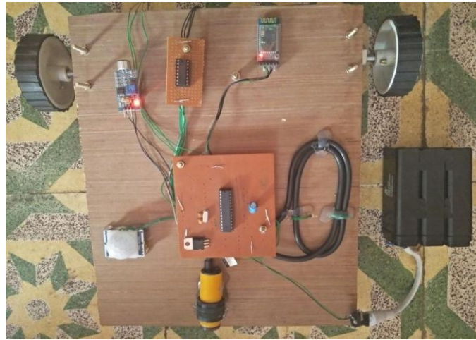
Fig.3 Hardware Module