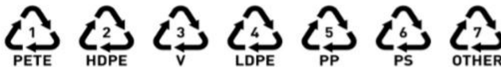
Figure no 1. List of recyclable plastics