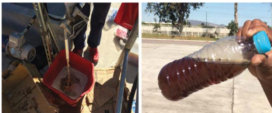
Figure no 3. Specimen of recycled plastic fuel.

Nitrogen cylinder is attached to the reactor. It is used to provide inert atmosphere to the reactor. The main purpose to use nitrogen cylinder is to melt the plastic and not to just burn it inside the reactor