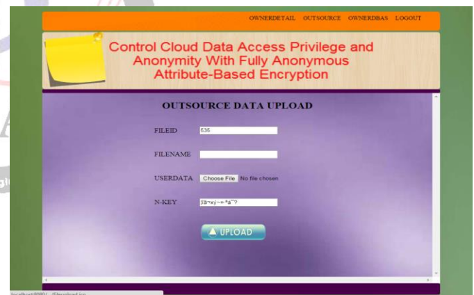
Fig 3. Database upload