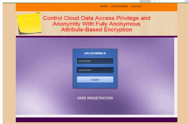
Fig 1. Login form

Fine-Grain concept using encrypted data convert into binary value fully secure for database.