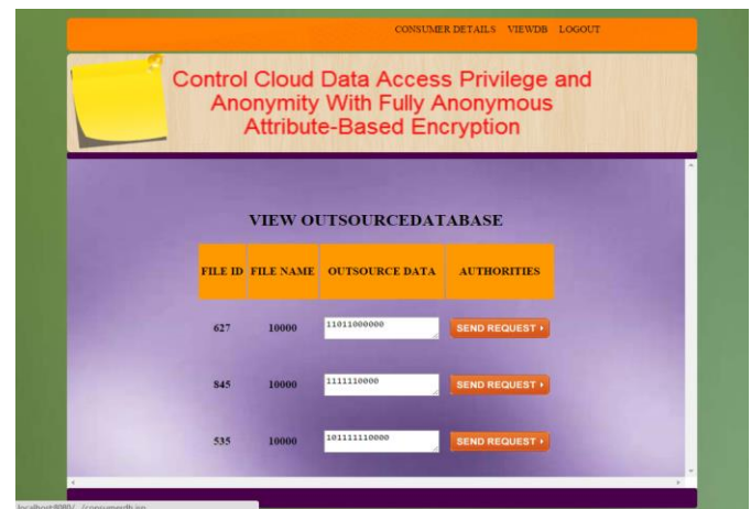
Fig 4. Consumer database

Various techniques have been proposed to protect the data contents privacy via access control.