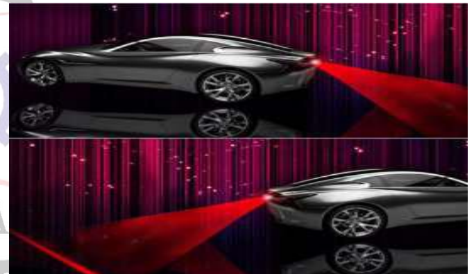
Fig. 4 Laser Attached Back Side

The back of car laser light is installed by mounting it to the rear of your car using the included 3M sticker to an area of your choosing, connecting the power to your back up lights, license plate lights, or brake lights, and then just adjusting the angle of the laser to point at a proper angle.