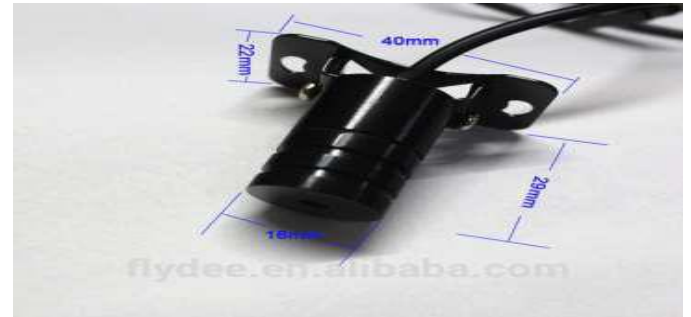
Fig. 3 Laser

Systems typically use a transducer which generates sound waves in the ultrasonic range, above 18,000 hertz, by turning electrical energy into sound, then upon receiving the echo turn the sound waves into electrical energy which can be measured and displayed.