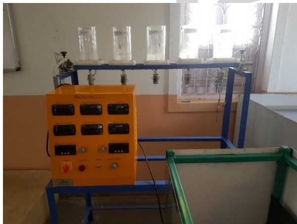
Fig. 2: Test rig