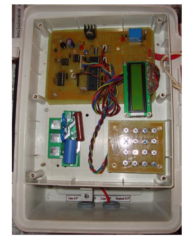
Fig. 2 ASLC 10KVA Unit

Work in this Paper is towards the design of a cost effective and energy efficient street light control system. It automatically switches ON lights when the sunlight goes below the visible region of our eyes. By using this system energy consumption is also reduced because nowadays the manually operated street lights are not switched off even the sunlight comes and also switched on earlier before sunset so this is reduced by using astronomical times clock. By using astronomical timer switch can reduce the energy conservation by a variations in month for example: In the month of march a sunlight stays more longer so by using astronomical times switch it can be automatically switch on the light after the sunset fully this is possible for all the month. A month variation is programmed by this more energy can be saved than existing system. A GSM system is used for controlling the device and for regular checking purpose and for informing fault.