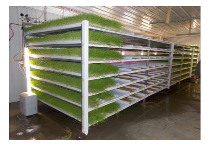
Fig4.1- Hydroponic Fodder System

The above diagram shows the basic structure of hydroponic fodder machine. Consisting of trays, sprinklers, channel materials of food grade PVC. By a unit dimension of 4.0*1.2*1.8m (L,W,H) we can get a daily output of 100 kg. It costs around 10000 [5].