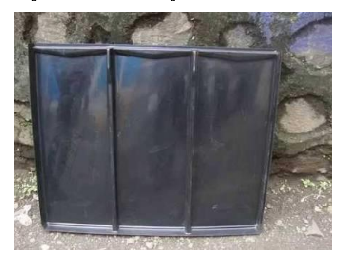
Fig3.1- Hydroponic Fodder Trays

They are the photo-chemically treated trays to prevent fungus on which the fodder is grown.