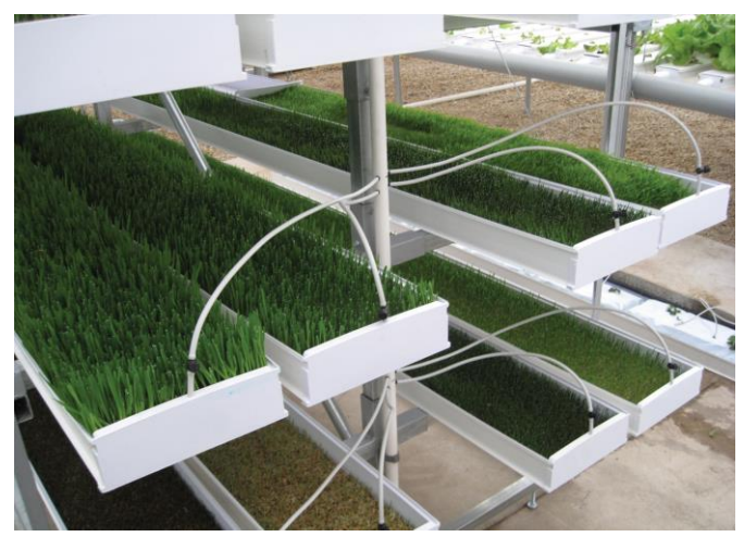
Fig4.2- Sprinkling System

The above figure shows the piping system and the dripping system used in hydroponics fodder system. The cultivation requires continuous water supply so we have used dripper and a timer to supply water. For supply of water we require a electric motor. It costs around 15000 for electric motor, timer and pipe systems [6].