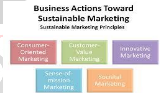
Fig-Sustainable Marketing Principles

Leadership can be either obtained through sustainable marketing. By being sustainable, the company can improve their image and obtain a competitive advantage. By adopting sustainable solutions now, organizations can leave the competition behind the reputation it takes years to establish.