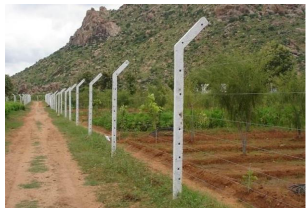
Fig. 1: Solar fencing for Agriculture land

Solar panels and solar energy has been prevailing from a decade along with their short comings, keeping these in mind there's an innovation of portable model for connecting the solar energy to the fencing and for the development of this project. IOT technology is used for this model. The performance of the solar power fence for agriculture is listed it states that there will be minimum wattage of solar energy available in India in any region, it also states that India amount 95% clear sunny days with average daily incidence of solar region at 5000 kcal /m 2 /day for 8 to 10 hours a day. [1, 8]